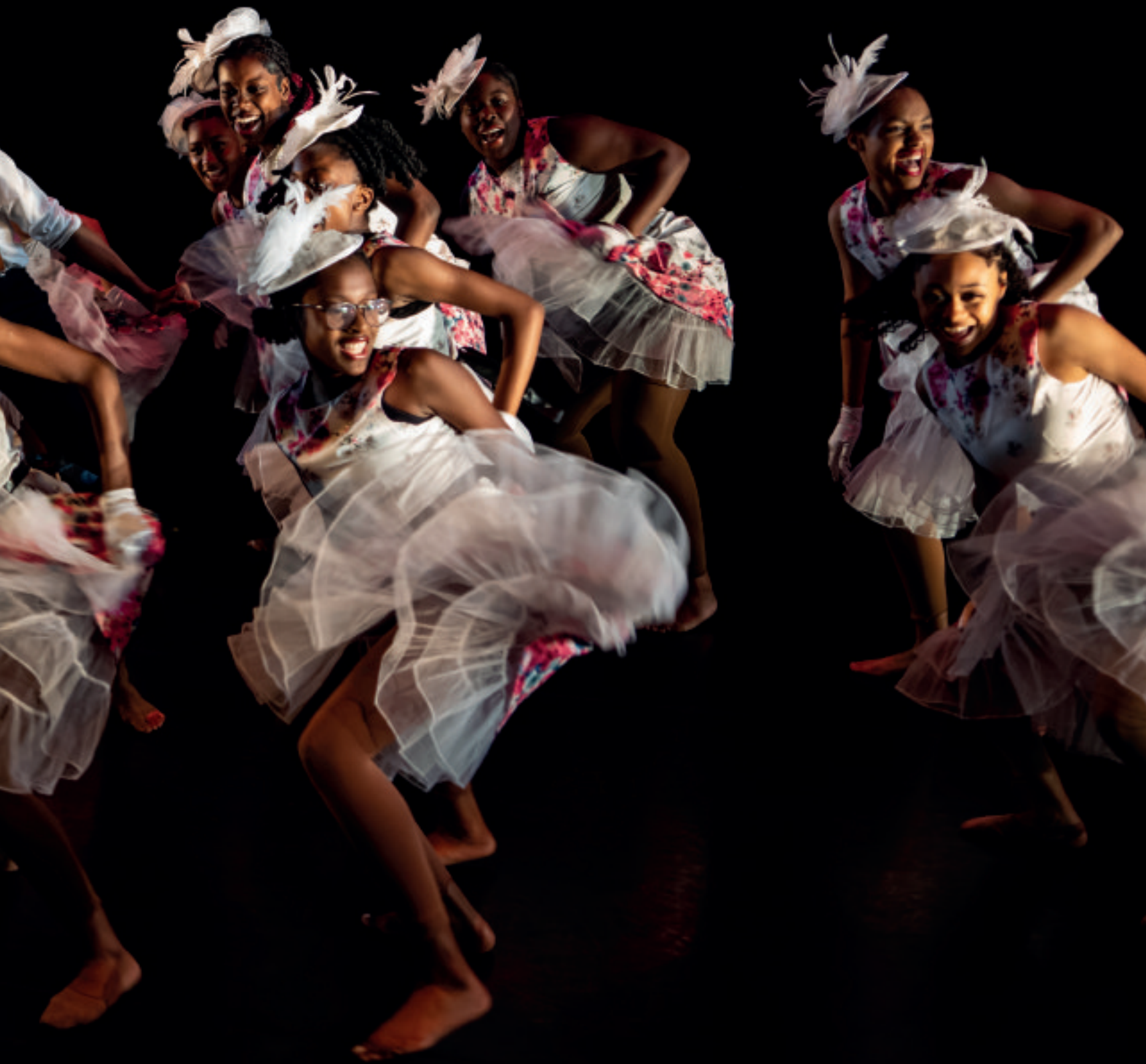
Artistry Youth Dance in Stand Up, choreographed by André Fabien Francis.